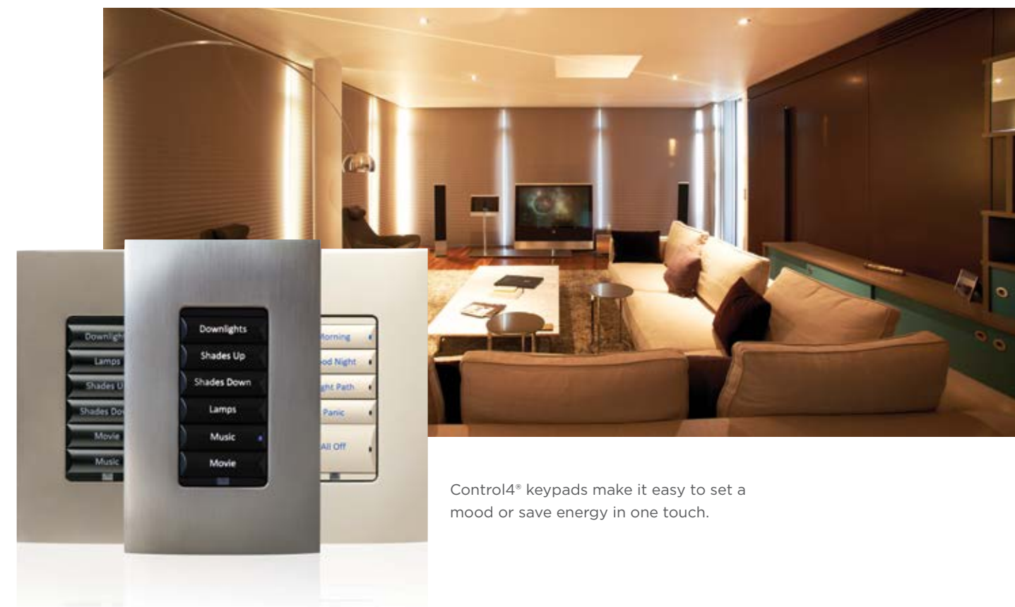
Control4® keypads make it easy to set a mood or save energy in one touch.

Combine lighting with curtain control and the whole house looks occupied, even when you're away. Or tie it into your home theater system so the drapes close automatically as the lights dim. You can control lighting scenes throughout your home from a central keypad or touch screen—no more dashing through the house to flip switches. And don't even think about construction hassles. With a Control4 system, you can turn any standard outlet into two smart outlets, ready to control just about any electrical device. It's really that easy.