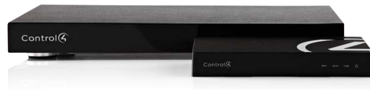
Control4® HC-800 Blazing fast, powerful, and flexible. The cornerstone for every control system.

Each model allows you to build anything from a basic home theater system to a whole-home automation solution. Sleek designs make them easy to either place behind a TV or mount in a rack, so they're always out of sight. Additionally, controllers offer features such as audio streaming, intercom capability and effortless control of your favorite consumer electronic devices.