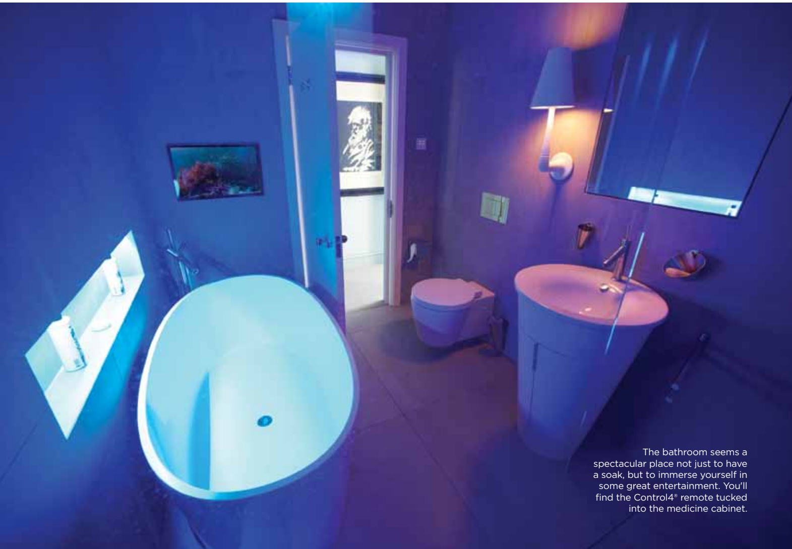
The bathroom seems a spectacular place not just to have a soak, but to immerse yourself in some great entertainment. You'll find the Control4® remote tucked into the medicine cabinet.