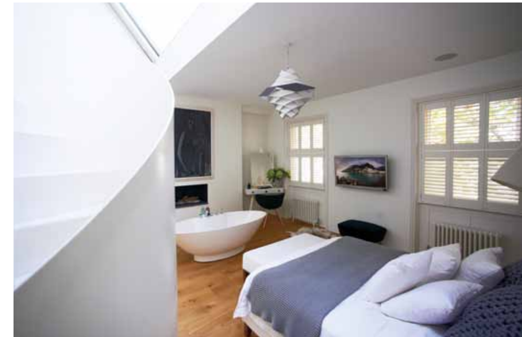
A helical staircase in the bedroom leads to a galleried office and roof terrace, where the skylight is controlled by the push of a button.